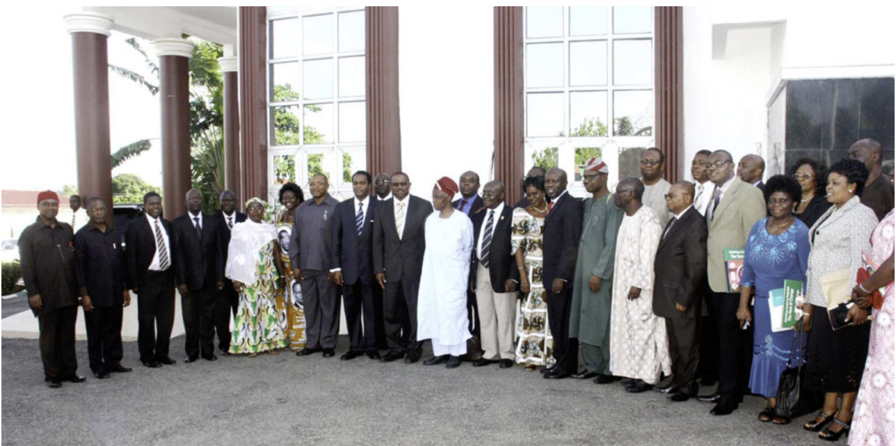
His Excellency Gov. Peter Obi with Members of the Technical Review Mission